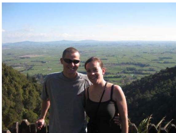
At the top of Wairere Falls

Please continue to pray for our involvement at this church - especially with the Youth Bible Studies and Fresh Expressions Services - that we would be a blessing and encouragement to the church while we are here. We are so grateful to God for this opportunity to serve Him and to get involved at St Mary's and we just really want to make the most of it!